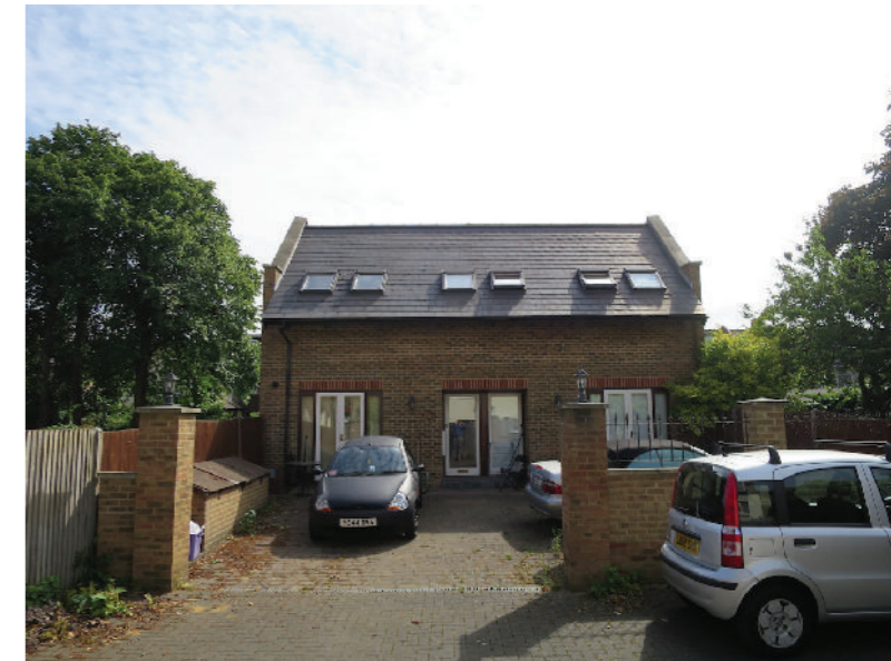
VIEW OF 154A WITH SITE TO THE LEFT