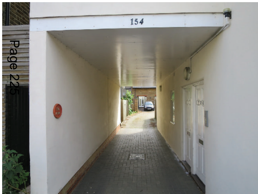
VIEW OF PROPOSED ACCESS FROM HARTFIELD ROAD. THIS ACCESS IS SHARED BETWEEN NO 150, 152, 154 & 154A