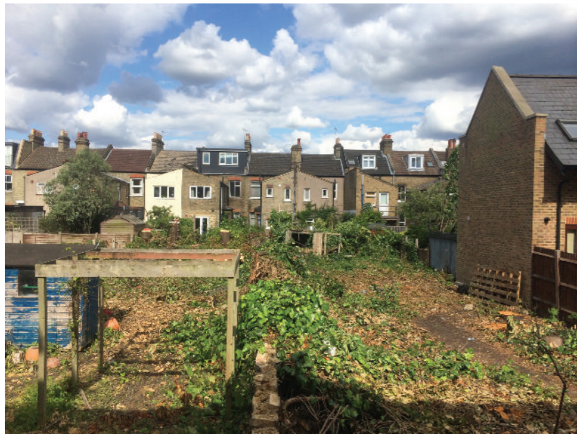
VIEW OF PROPOSED SITE LOOKING NORTH EAST FROM 152 HARTFIELD ROAD WITH CAR PARK OF 146 & 148 TO THE LEFT