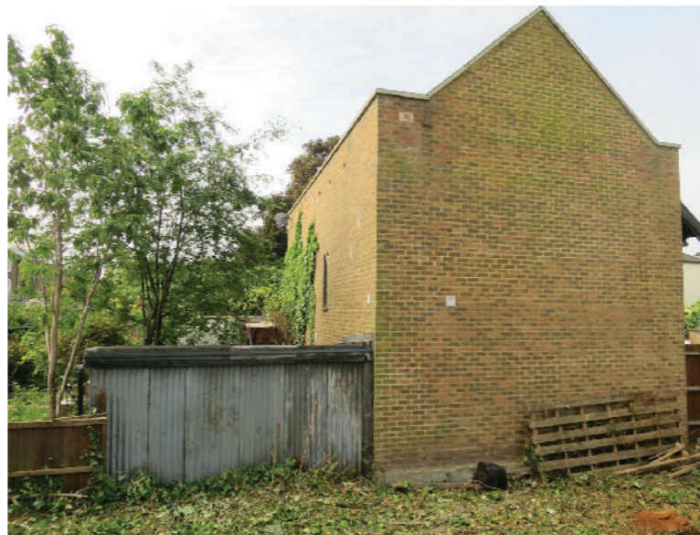
VIEW LOOKING SOUTH AT FLANK WALL OF NO. 154A