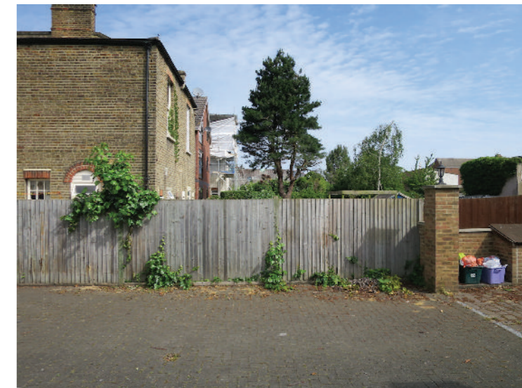
VIEW OF PROPOSED ENTRANCE INTO LAND TO THE REAR 150 & 152 HARTFIELD ROAD